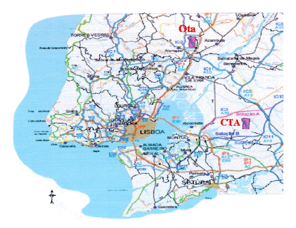
Figure 1 – The two alternative sites for the location of the NAL (Ota and CTA zones)

A preliminary decision of the Government followed, selecting the CTA zone for the NAL, which was confirmed a few months later by a Council of Ministers Resolution, after the completion of a process that included a public consultation, under a Strategic Environmental Assessment of Transportation Investments, in accordance with the present Portuguese legal framework (transferred from the European Directive 2001/42/CE).