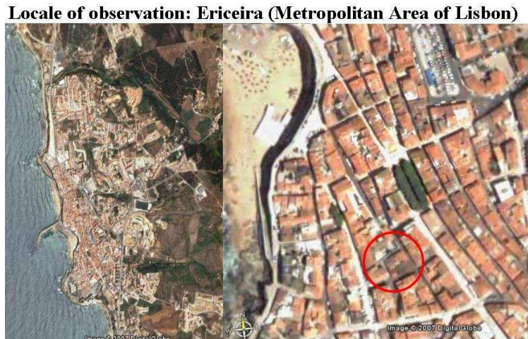
Fig. 1 - Area of study

Alongside the observation of the relation between space and practices of use/appropriation on the part of the local Brazilian community, it was also important to: