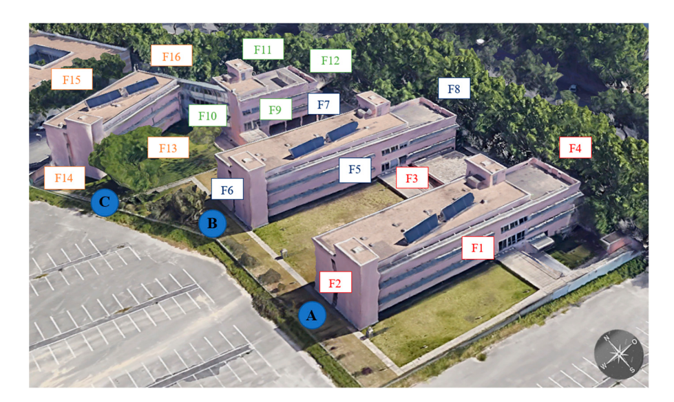
Figure 2. Representation of the inspected building complex identifying the 16 façades.

Table 2. List of the most relevant anomalies identified in the case study, their causes and some recommendations to minimize the occurrence.