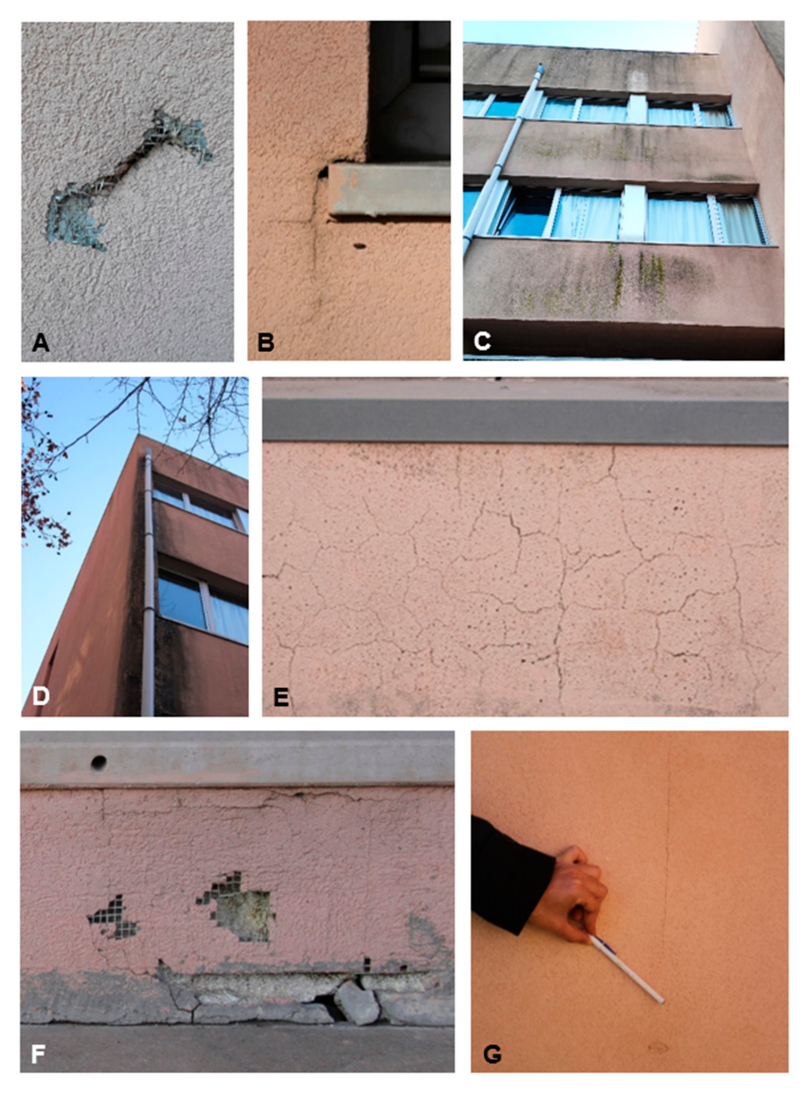
Figure 3. Relevant anomalies identified on the façades: (A)—perforation of the system; (B)—cracking of the rendering system in window openings; (C)—biological colonization; (D)—water runoff marks; (E)—non-oriented cracking; (F)—detachment of the finishing coat; (G)—oriented cracking.

Causes: In this case, the cracking is oriented and aligned with the joints of the insulation plates. This anomaly normally occurs due to the stiffness and the linear thermal expansion coefficient of the thermal insulation (EPS). This coefficient is about five times higher than that of the rendering system. As a result, the insulation plates bend to the exterior due to thermal variation between their outer and inner surfaces. This phenomenon generates great tensions in the rendering system that can lead to cracking. Recommendations to minimize the occurrence: The application of a thermal insulation material with lower stiffness could be the solution. Therefore, the thermal insulation shall be chosen also considering the environmental conditions of exposure. Additionally, the compatibility between the rendering system and the thermal insulation material must be guaranteed.