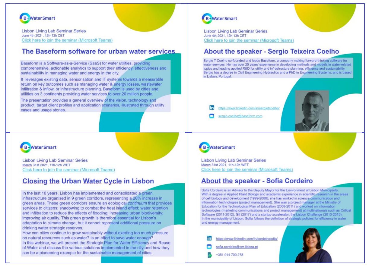
Figure 2: Lisbon Living Lab session fitting on L3 type of action

As an example of the L3 initiatives, Lisbon Living Lab organises a bi-monthly seminar to support the partners' work not only for BWS people but also beyond. These seminars aim at facilitating the integration of BWS into the partners' long-term strategy and activities and allow partners to become more familiar with each other's work, helping to foster durable synergies. Figure 2 illustrates two sessions organised by Lisbon Living Lab.