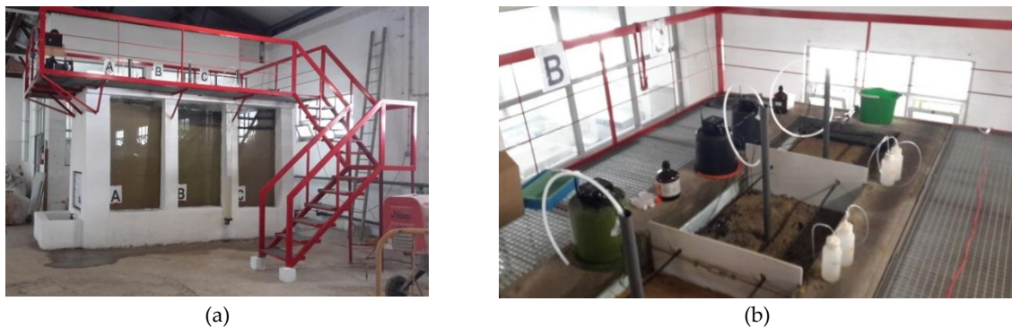
Fig. 1. LNEC physical (sandbox) model: (a) Global view; (b) Monitoring devices for saturated and vadose zones

The physical (sandbox) model was used to conduct laboratory large scale infiltration and tracer tests, both for saturated and non-saturated conditions. It allowed determining the soil (1) infiltration rate and (2) contaminants retention and/or degradation capacity. The facility is approx. 3.5 m long, 1 m wide and 2 m high (Fig. 1) and can be filled with the porous medium (soil) to be studied, in this case the Melides sand.