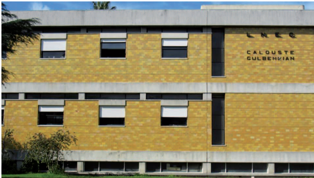
Figure 3: Building Calouste Gulbenkian, 1962, Laboratório Nacional de Engenharia Civil, Lisbon. Architects Januário Godinho and João Henrique de Mello Breyner Andresen

It seems important to point out that, together with Brazil, the use of azulejo in modern architecture is something unique. And in the European context, its use in Portugal is unique indeed and singularly interesting because it emerged, not only as the inheritance of a cultural past, but also as a mark of individuality towards the standards of architecture at the time. The use of azulejos in the modernist architecture in Portugal has historic and aesthetic values. There is also a technical side which we will exclude from the present discussion until further research. The historic side was pointed above and is particularly enhanced by the fact that the international modern movement had adopted canons characterised by pure volumes, sober lines and great rationality that excluded most forms of decoration. Such rules also had an expression in Portugal [20].