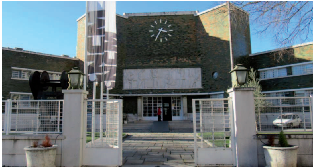
Figure 2: Casa da Moeda 1942-48, Lisbon. Architects Jorge Segurado e António Varela