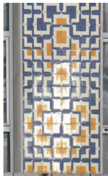
Figure 4: Building in Praça Raphael Bordallo Pinheiro, 1970s, Lisbon. Architects Diogo José de Mello and João Andrade e Sousa. Azulejos author António Vasconcelos Lapa

In this sense, it is important the effort to define their value not only as a characteristic aspect of Portuguese culture, but also as an unique regional trend in the Modern Movement in Europe, that cries out for preservation now, so that they may be here to be appreciated in the future.