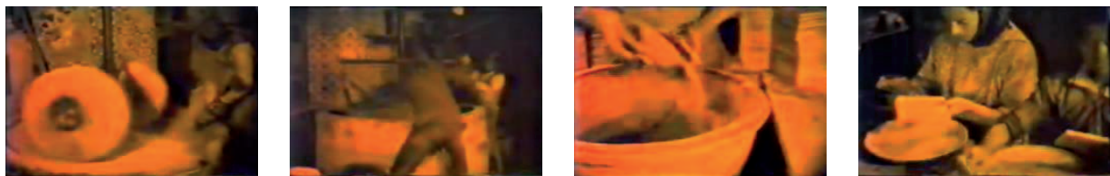
Figure 3: Grinding of the glaze, glazing the azulejos and correcting the glaze layer. Video print screen (Matos, 2014)