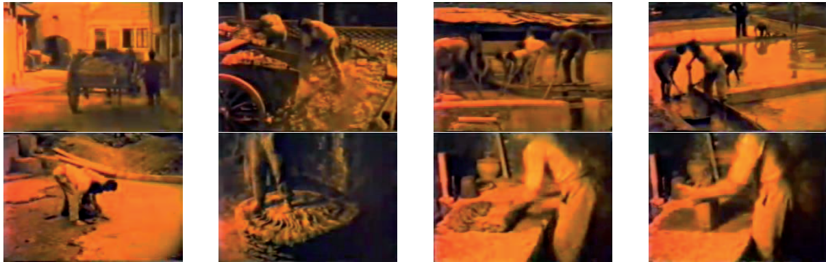
Figure 1: Clay and paste preparation. Video print screen (Matos, 2014)

firing (Figure 4) are depicted in this video. In the final years of production large public art panels were produced by the factory such as João Abel Manta's large Gulbenkian Avenue wall and the Ivan Chermayef Lisbon Oceanarium façade azulejos .