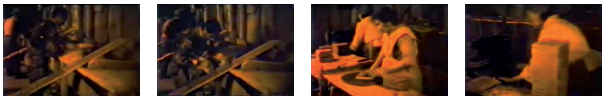
Figure 2: Azulejo molding and straightening. Video print screen (Matos, 2014)