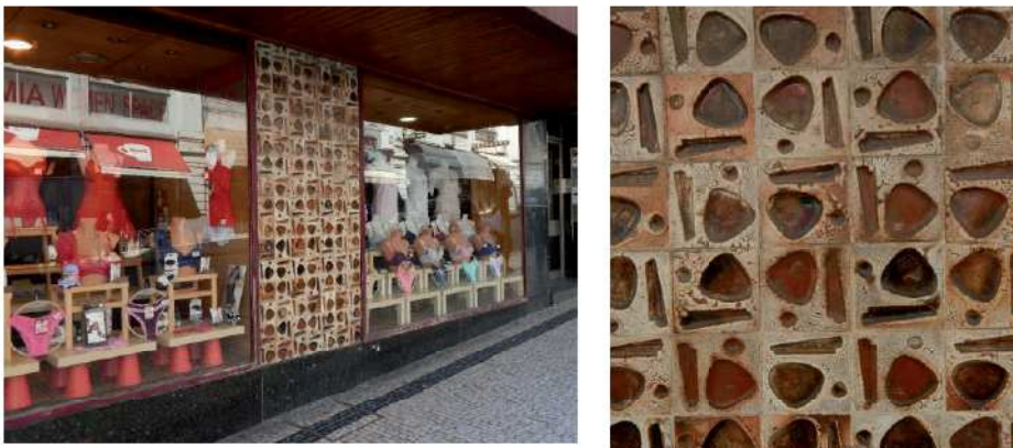
Figure 13: Rua de Sá da Bandeira N° 331, Porto