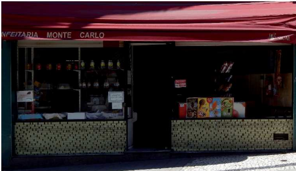
Figure 10: Coffee shop in Rua da Boa Hora N° 2, Porto