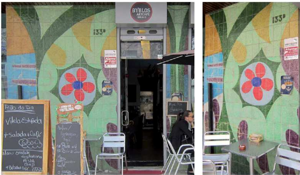
Figure 5. Coffee shop in Avenida Miguel Bombarda N° 133 , Lisbon

Figure 5 is an example of a simple coffee shop made remarkable by a lovely front with an artistic azulejos panel decorating the exterior seating area destined for clients.