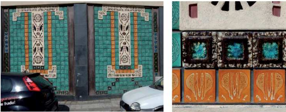
Figure 12: Polynesian Bar in Rua das Águas Férreas N° 9, Porto

amusing allegory because in Portuguese the sole is called “planta do pé” - plant of the foot, while the tip of the shoe is called “bico do sapato” – beak of the shoe).