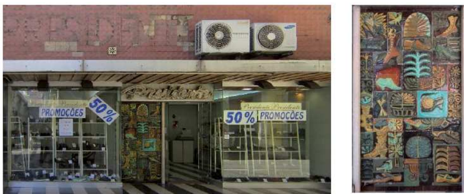
Figure 14: Shoes shop in Praça do Rossio , downtown area of Lisbon