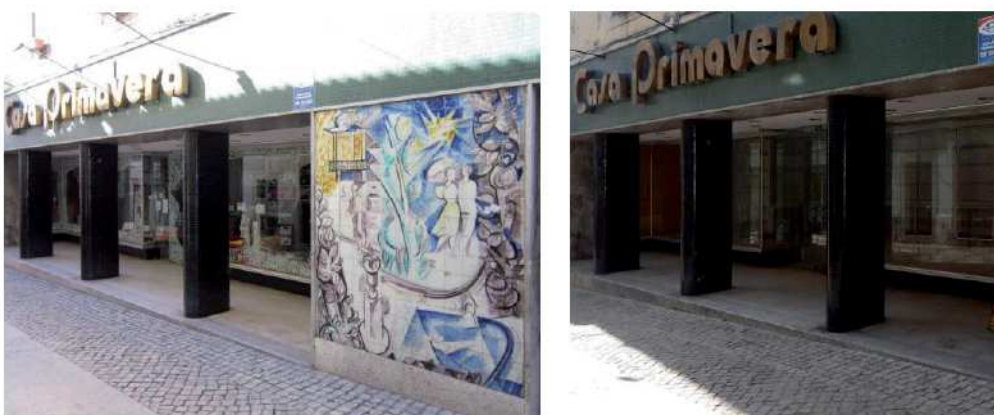
Figure 3: Casa Primavera shop front. Rua Miguel Bombarda N° 4 , Torres Vedras

Figure 3 illustrates a case in Torres Vedras of an artistic panel decorating a shop front whose design is only whole with the panel. The panel is signed “Daciano” and dated “1955”. The whole shop must have been designed by Daciano da Costa (1930-2005) Portuguese artist and remarkable designer. One of his works (from 1972) is precisely the congress centre of LNEC where GlazeArt2018 takes/took place, including all the decoration, furniture and lightings. This shop, which we identified, is one of his earliest works and the signed panel one of the very few examples of his art on azulejos. The shop closed and Museu Nacional do Azulejo contacted the Municipality to offer information on the heritage value of the shop front.