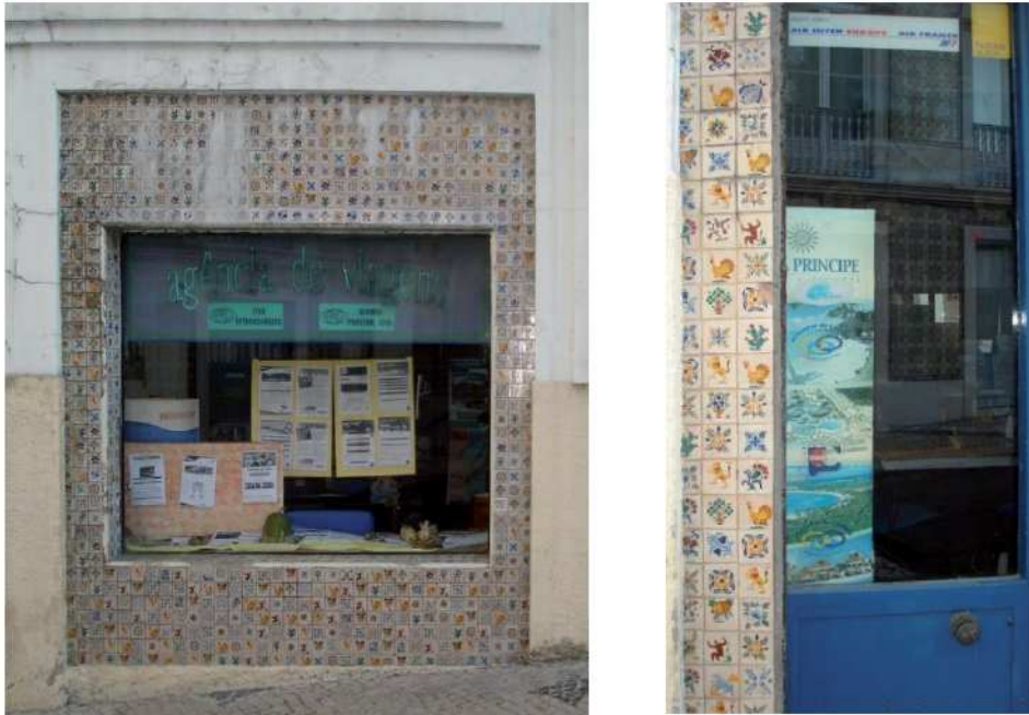
Figure 15: Travel agency in the centre of the town of Torres Novas

Figure 15 presents an interesting shop located in a little-visited town, Torres Novas, and it is a rare example of single figure tiles from the 1940-50s that due to its smaller dimension (one fourth of the normal size of an azulejo) are called in Portuguese lambrilhas. Another example is shown in figure 16, where glazed ceramics with a protruding face and in shades of the same colour, create texture, variety and interest to areas that would otherwise be rather plain.