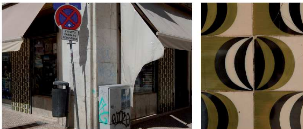
Figure 1: Rua da Portas de Santo Antão N° 77 , Lisbon

Figure 1 shows an example in Lisbon, where the type used was designed by the well-known artist Maria Keil (1914-2012) [7] who personally identified tiles of the same pattern in the collections of the Museu Nacional do Azulejo as her own. However, as far as we know, this particular application was never mentioned in the literature.