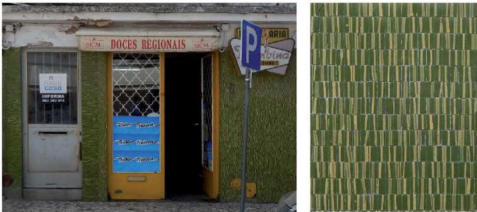
Figure 11: Regional shop in Rua de Mértola N° 65A, Beja

A slightly different case often neglected is the example in the figures below, made by using glazed ceramic tiles. The first (figure 12) is an interesting example in Porto, it is a modern bar inspired by the Polynesian tradition. The execution of the shop front albeit recent uses modern azulejos and bears witness to a remarkable technique: the panel composition is made with sets of differently textured azulejos, including designs by Ferreira da Silva for Secla, with fused glass areas and tiles by Fábrica Constância of Lisbon (both ca. 1960s), and the striking contrast between them creates an impact on the viewer with an unmistakable tiki flavour. The second case (figure 13) is also a panel in Porto, where ceramic plaques used have the same design and colours, white and orange or red. However, the position of application is different, as if it was a "game of position" where the impact on viewers is obtained through texture and position. The third case (figure 14) is that of a shop in the Baixa of Lisbon, where the panel is composed by a set of ceramic plaques of different sizes themed on shoes, plants and birds for a shoe shop (an