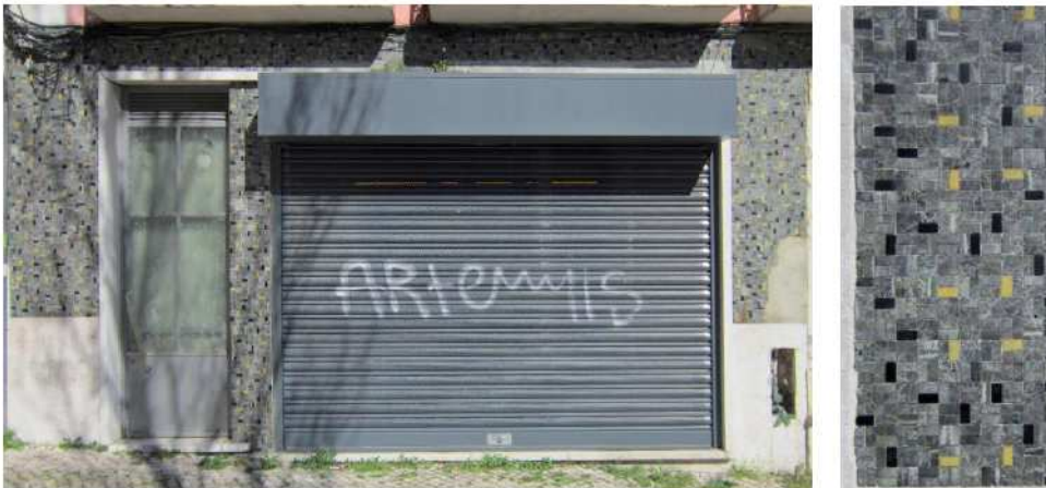
Figure 9: Rua Gomes Freire N° 14, Lisbon