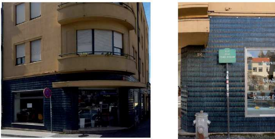
Figure 16: Rua de João Pedro Ribeiro Nº 595, Porto