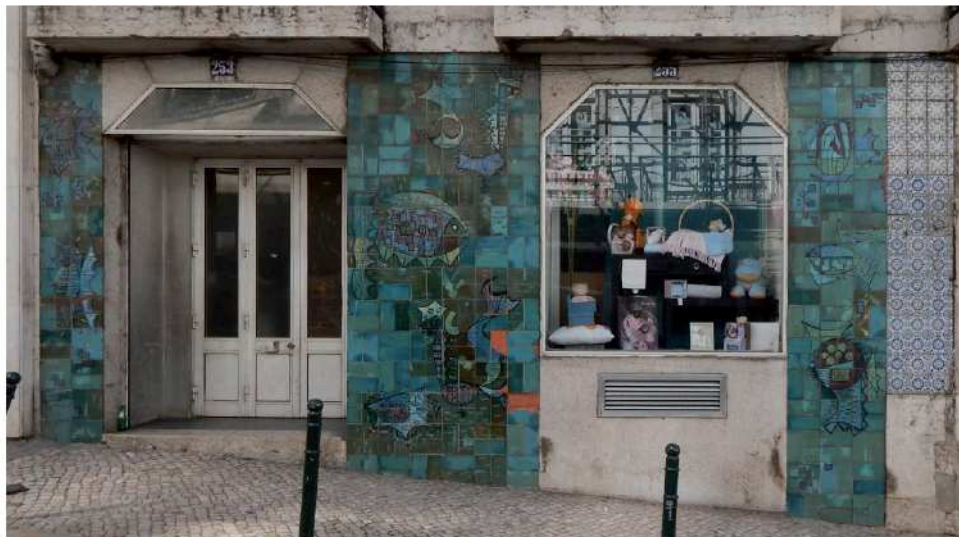
Figure 6: Azulejos panel made of ceramic plaques in Rua da Madalena N° 253 , Lisbon

Figures 6 and 7 are interesting examples of azulejo panels integrated in shop fronts. In the first, the composition is in blue colours with ocean inspired motifs, such as geometric fish and was once the front of a restaurant specialized in seafood. In the second, the composition is made by azulejos in "warm" colours and with Porto city represented. However, in this case, the design is only perceived from a distance.