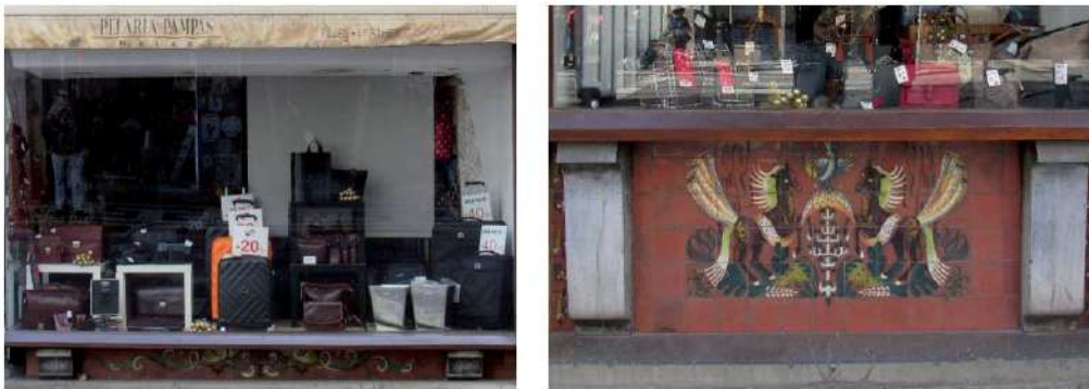
Figure 2: Shop Pelaria Pampas in the Baixa area of Lisbon, located at the intersection of Rua da Conceição N° 65 with Rua da Prata

Figure 3 illustrates a case in Torres Vedras of an artistic panel decorating a shop front whose design is only whole with the panel. The panel is signed “Daciano” and dated “1955”. The whole shop must have been designed by Daciano da Costa (1930-2005) Portuguese artist and remarkable designer. One of his works (from 1972) is precisely the congress centre of LNEC where GlazeArt2018 takes/took place, including all the decoration, furniture and lightings. This shop, which we identified, is one of his earliest works and the signed panel one of the very few examples of his art on azulejos. The shop closed and Museu Nacional do Azulejo contacted the Municipality to offer information on the heritage value of the shop front.