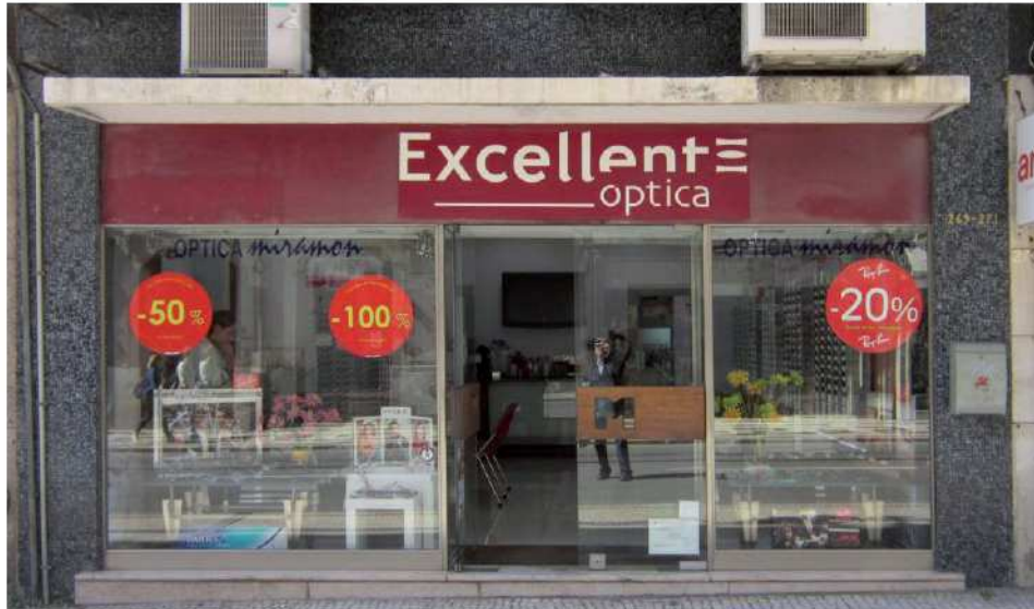
Figure 8: Shop in the Baixa of Lisbon. Rua da Prata N° 269-271

The images below show the application of linings with those small tiles in some towns visited, such as Lisbon, Porto and Beja and the type of application, at street level on shops front. These are just examples that were considered worth mentioning but many others, we believe, should be cared for and safeguarded.