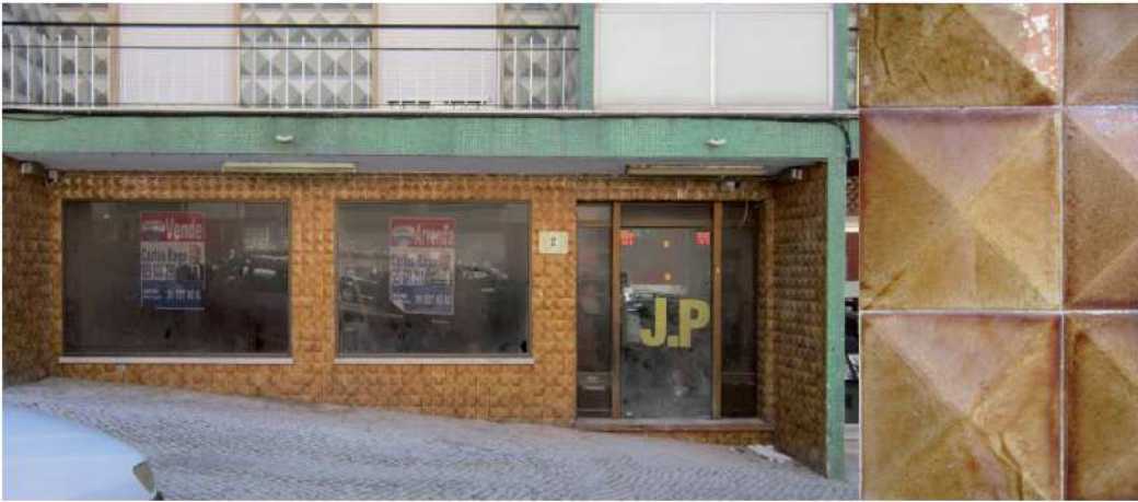
Figure 4: Rua Ricardo Espírito Santo N° 8A , Lisbon

The following images demonstrate several modern shop fronts in different towns where the azulejos are integrated. The panels found often present artistic compositions and the beauty of their integration may stem solely from the azulejos, mostly from the integration, or both when the azulejos are harmonized with the rest of the shops or buildings.