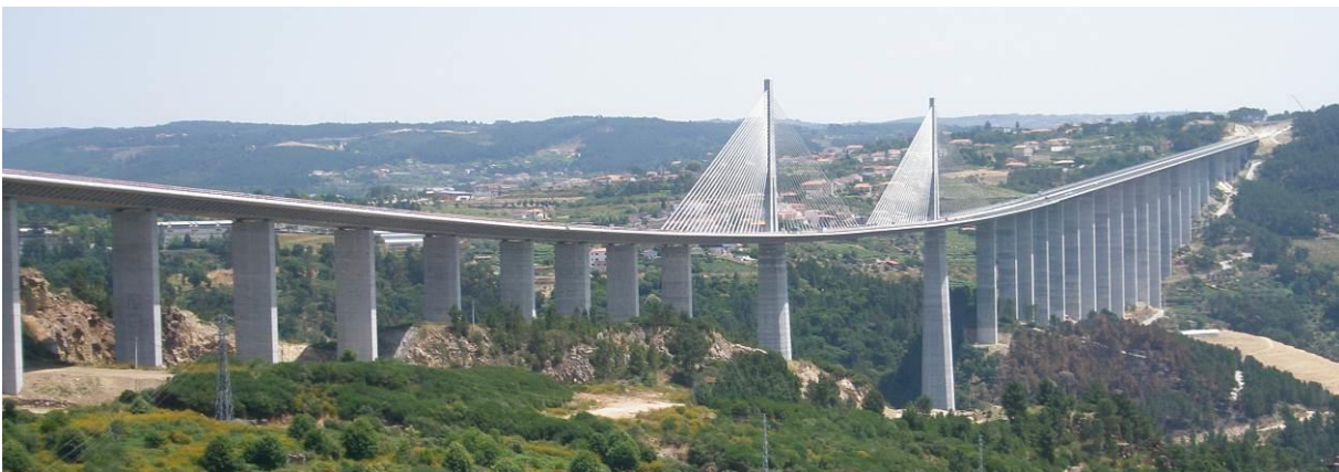
Figure 4.1 — Corgo Viaduct: general view.

The Corgo Viaduct in the A4 highway, cross the Corgo River near Vila Real, in northern Portugal. The total length of the viaduct is 2800m, divided into three substructures: the main viaduct, a stay cable bridge with a middle span of 300m, and the north and south approach viaducts (see Figure 4.1).