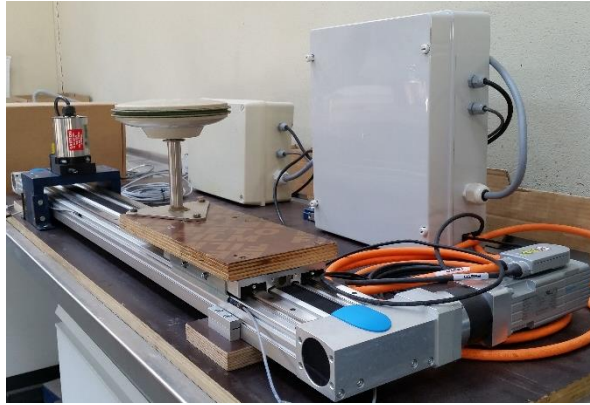
Figure 3.3 — Linear displacement axis at FEUP.