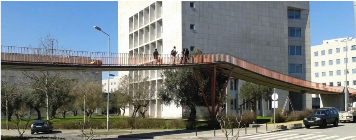
Figure 4.2 — Footbridge at campus da FEUP.

catenary-type shapes joined by a circular curve over the inter-mediate support. The design rectangular cross section is 3.80 \times 0.15 \text{m}^2 .