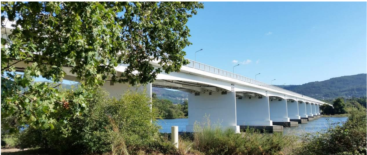
Figure 4.3 — Lanheses bridge over Lima River.

Lanheses bridge crosses Lima River near Viana do Castelo (see Figure 4.3). It consists in a multi span single girder deck built in reinforced and prestressed concrete with a total length of 1218m, simple supported in 40 columns and two abutments. South side abutment is a fixed end support, while all the rest have installed slide bearing supports.