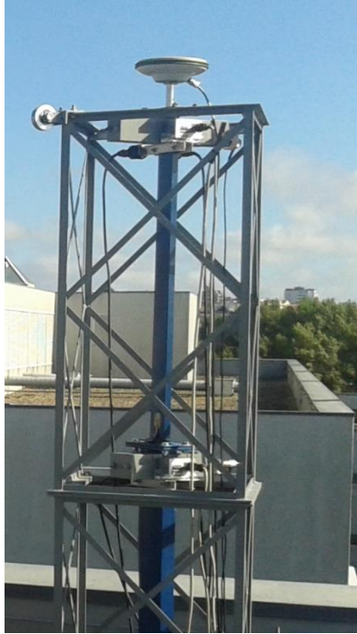
Figure 3.2 — Experimental model developed at FEUP.

Several static and dynamic loading tests were performed allowing to gather extensive data. The collected results were, at same time, exploited into various signal processing procedures and multi-sensor fusion techniques. The developed model can also be used into future tests and exhibitions.