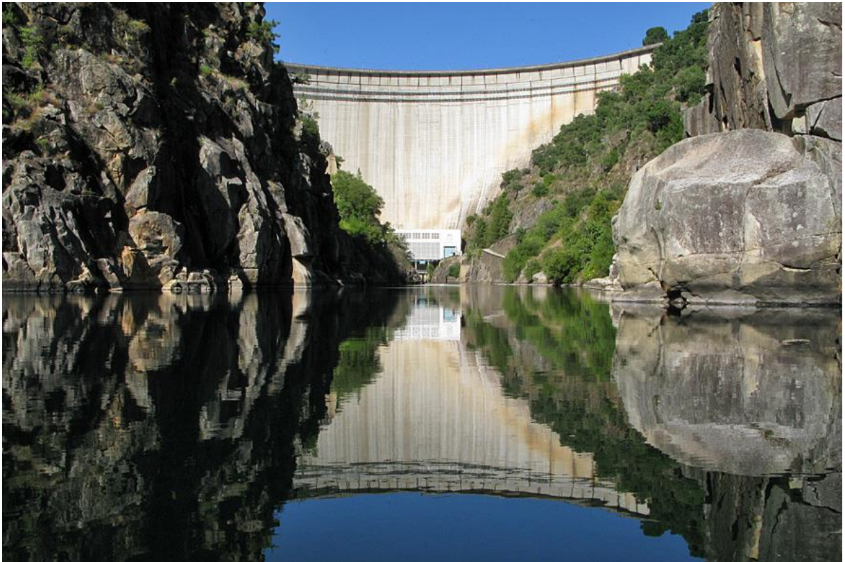
Figure 5.1 — Cabril dam: general view.

In this task we intend to improve the monitoring system of Cabril dam (Zêzere river), a sixty years old dam, that is the highest Portuguese arch dam (132 m). In this dam significant horizontal cracking occurred near the crest since the first filling of the reservoir, and a concrete swelling process was recently detected; the water level presents important variations along the year. In what concerns the monitoring system, although it is quite complete, it should be noticed that only the dynamic monitoring component is automated, since 2008. This component includes the accelerations measurement (1000 Hz) in the upper zone of the dam and insertion, with 16 uniaxial accelerometers and three triaxial (equipment installed by the Project Team, thanks to previous funding from FCT, REEQ/815/ECM/2005).