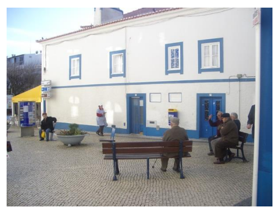
Fig 6. One important meeting point of Portuguese