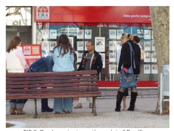
FIG 5. One important meeting point of Brazilians

These short testimonies give a synopsis of the views of Brazilians about the country they now live in and its people, providing us with information on their social representations of themselves and others.