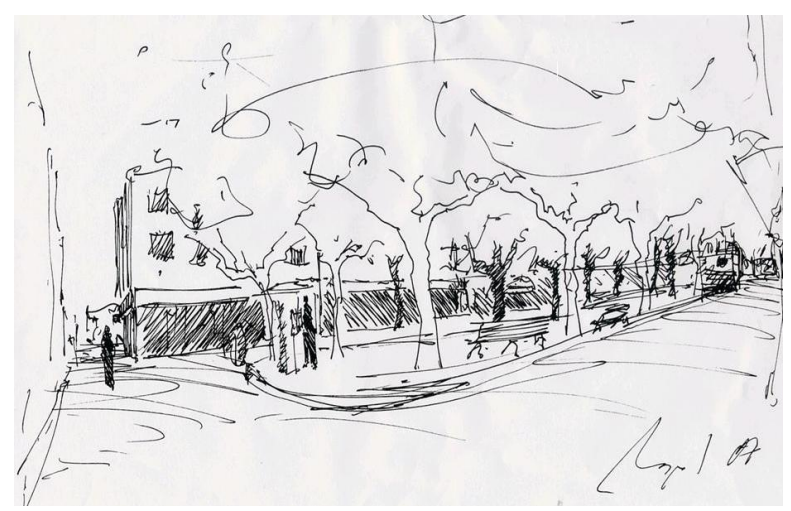
FIG 4 - Drawing where of the practices and individuals are observed

The main plaza of Ericeira provided a central setting for the observation. Nevertheless, it was interesting how, in this scenery, the behaviors and practices, the corporeal expressions gained forms that, being flexible, more or less intense in their duration, repeated themselves with some intensity, thus transforming the setting into a set of focal points. See, once more a short reproduction of the field notes by MV and JPM: