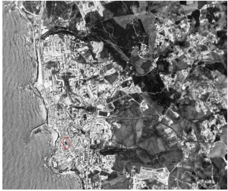
FIG. 1 – General overview of Ericeira in the plaza in the context of Ericeira