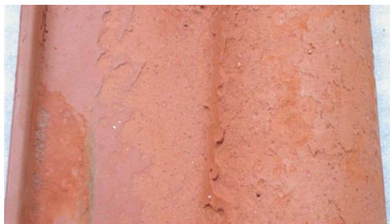
Fig. 1 Natural damage

Clay tiles are largely used in traditional construction in Portugal. In coastal zones some cases of accelerated decay have been affecting the roofing tiles durability, apparently due to the exposition to salt mist atmosphere. The crystallization of soluble salts is considered one of the main causes for the degradation of porous construction materials (Rodrigues and Gonçalves 2006).