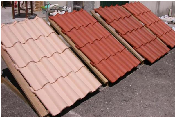
Fig. 4 Natural weathering tests

specimens from 8 different types of tiles have been subjected, in a climatic chamber (figure 2), to sets of 10, 20 and 30 cycles of wetting with a salty mist and subsequent drying. These tests caused different types and levels of alteration and degradation in different kinds of clay tiles (examples in figure 3). Hydrophobic specimens don't show immediate defects but they can suffer huge degradation (bowing and plaques) if the solution can pass through the protected surface. Non-hydrophobic tiles, both red and white, show low to medium degradation level characterized mainly by pitting, some disaggregation and peeling.