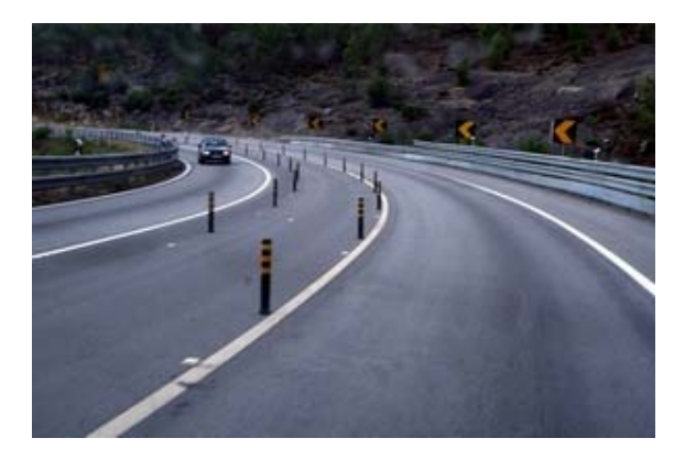
FÎGURE 2 IP4 - section with climbing lane suppressed.