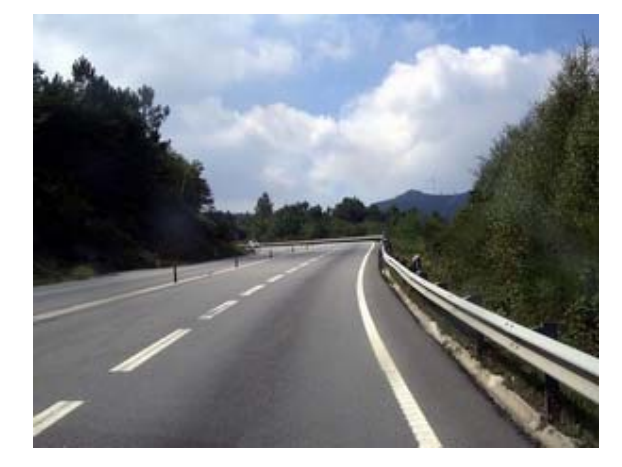
FIGURE 1 IP4 - section with climbing lane.

The analysed stretch of IP4 is a two lane single carriageway road, with an additional lane for slow vehicles in almost all its ascending gradients. The generic cross section is formed by a 3.5 m lane in each direction, an additional 3.0 m lane in alternate directions for slow vehicles, and paved shoulders with 2.5 m (one lane direction) or 0.5 m (dual lane direction).