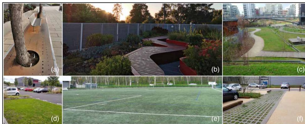
Figure 2 | Example of stormwater management infrastructure where the main function is not related to water management: (a) street furniture (Melbourne, Australia), (b) roof (Burnley, Australia), (c) public park (Paris, France), (d) parking lot (Villeurbanne, France), (e) soccer field (Villeurbanne, France), and (f) pedestrian or cycle path (Villeurbanne, France).

Some efforts can be reported regarding other aspects than hydraulic and treatment performance. Several authors have considered cost-effectiveness via a cost analysis ( Taylor 2003 ; Lee et al. 2010 ; Li et al. 2021 ). Duffy et al. (2008) conclude that SUDS are more cost-effective based on a whole-life costing analysed than traditional sewers. A relatively popular theme are environmental aspects such as the heat island effect and air quality ( Norton et al. 2015 ; Zölch et al. 2016 ; Jayasooriya et al. 2017 ; Bartesaghi Koc et al. 2018 ; Saaroni et al. 2018 ), where urban green infrastructures are demonstrated to contribute to urban heat mitigation. Bianchini