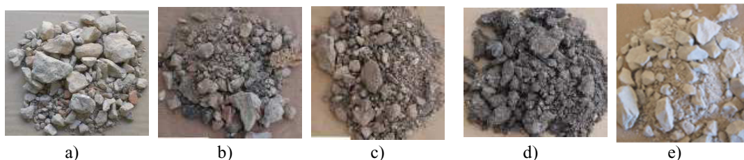
Figure 1: Materials recycled and natural selected: a) crushed concrete (CC), b) crushed mixed concrete (CMC), c) crushed reclaimed asphalt pavement (CRAP), d) milled reclaimed asphalt pavement (MRAP), and e) natural crushed limestone (NCL)

Along with the assessment of release of dangerous substances of the selected materials, the experimental research program also evaluated their engineering properties (geometrical, physical, and mechanical), in both instances applying European standards whenever possible. Concerning engineering properties, only the constituents of recycled aggregates, determined according to NP EN 933-11 (2011), and the grain-size distributions of recycled and natural aggregates, determined according to EN 933-1 (2012), are presented in the paper. As mentioned before, the leachability of the recycled and natural materials was studied in laboratory using batch tests, performed according to European standard EN 12457-4 (2002). The field leaching tests, lysimeter tests were performed according to the procedure described hereinafter.