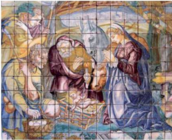
Figure 1 – The center part of the panel entitled Nossa Senhora da Vida.