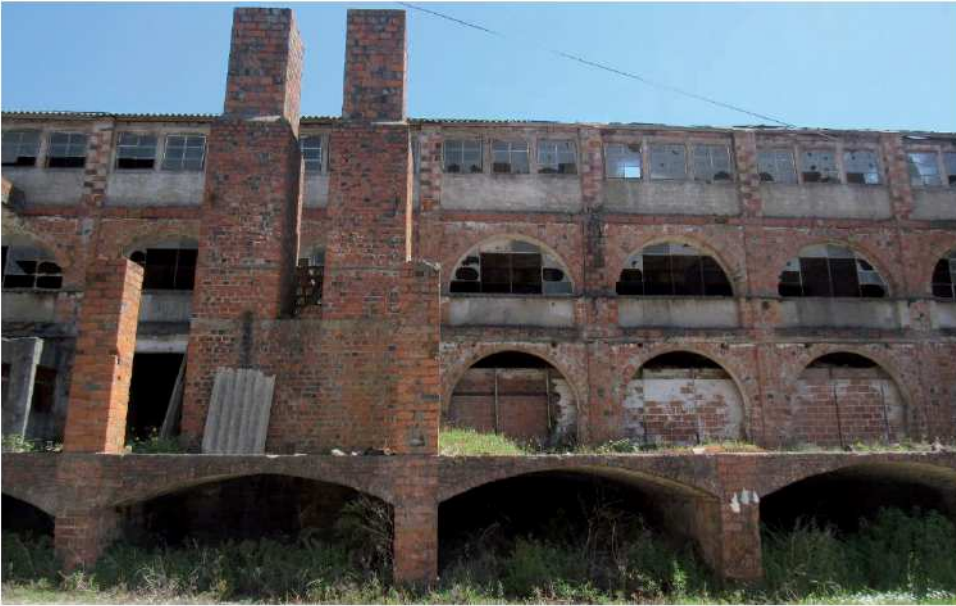
Figure 3: The factory building. Caxarias , 2018

(figure 4) which is very interesting since it seems to work out like a catalogue of the products or as an invitation for those who would go to the factory and could see a showcase beforehand.