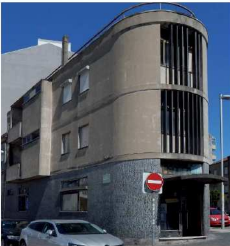
Figure 11 and 12 are two examples where the lining covers a larger area, creating an interest in façades that would otherwise be plain and uninteresting. In the first case, the building is in a corner of the street and its unassuming modern design contrasts with the rather sumptuous lining at street level.