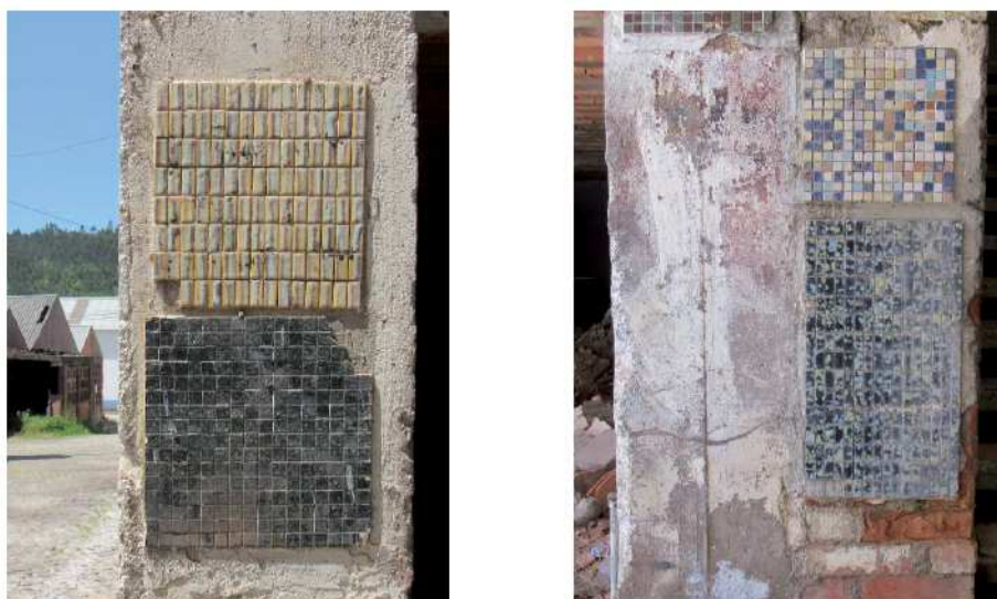
Figure 5: Tijomel mosaics applied on the walls in the factory building. Caxarias, 2018

The land around the factory was, however, divided and sold to several owners [13]. The study of the production of this company is particularly important given their uniqueness. Such study may also reflect on the knowledge of the materials and contribute to a more conscious future intervention of this type of coating.