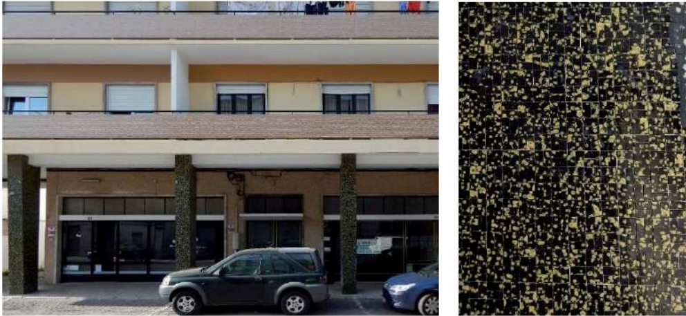
Figure 21: Rua dos Palomes N° 8, Torres Vedras