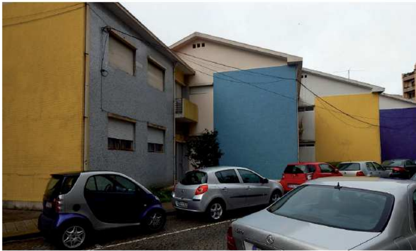
Figure 13: Three buildings with the “azulejos” Tijomel in Porto. Rua do Seixal Nº 75

Figures 14 and 15 depict some Tijomel coatings in different colours and patterns applied in buildings of Porto and Ourém, the city of extinct Portuguese factory Tijomel.