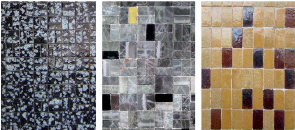
Figure 19: Detail of applied glazed ceramic Tijomel in different buildings in Lisbon. Left: Rua da Prata N° 269 ; centre: Rua Gomes Freire N° 6 ; right: Rua Combatentes da Grande Guerra N° 43 (Moscavide)

Other types of Tijomel mosaics found in Lisbon buildings are shown in figure 19, which express once more a clear intention to communicate aesthetic appeal with the use of these coatings.