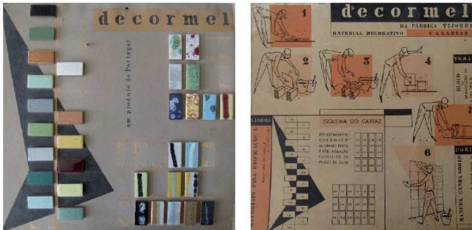
Figure 2: Catalogue from the archives of Laboratório Nacional de Engenharia Civil of the section "decormel" with different Tijomel mosaics available

In its grounds, there was a canteen, medical service, school, library, constituting a model of social assistance unusual for the time. It would have had approximately 300 workers and some modern artists, such as Júlio Resende who developed projects there [11, 13]. One of his work is the panel "O Café" where he used glazed bricks, present in Confeitaria Sical in Porto [16]. Figure 2 shows a catalogue from the section "decormel" and the different types of Tijomel mosaics available.