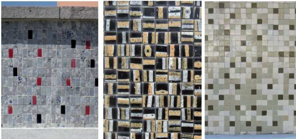
Figure 15: Detail of applied Tijomel mosaics in different buildings in Ourém. Left: Av. Bombeiros Voluntários N° 55 ; centre: Praça da República N° 11 ; right: Rua Teófilo Braga N° 8