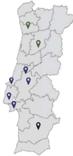
Figure 8: Localities visited where Tijomel tiles were used