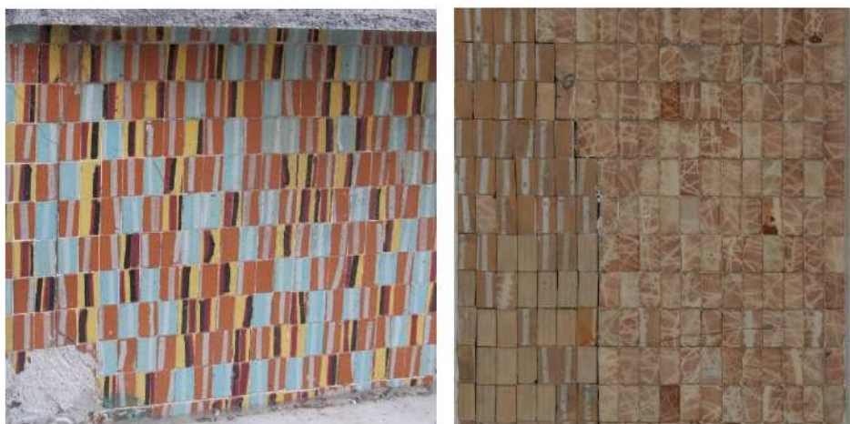
Figure 1: Examples of Tijomel mosaics. Left: Rua dos Olivais, Viseu ; right: Rua dos Palomes, Torres Vedras (integrating two different patterns)

The azulejo is a traditional art in Portugal, much more than an object, thus encompassing a wealth of shapes and dimensions. In this sense, the authors consider important to mention a type of glazed ceramic coating that came recently to their attention whose dimensions are different from the common Portuguese azulejo (ca. 140 x 140 mm). These are glazed ceramic units with facial dimensions 18 x 38 mm produced in many colours and abstract patterns (figure 1). These coatings were widely used in Portuguese modern architecture, however, apart from a slight reference to these mosaics found in the website of Cerâmica modernista em Portugal [9], there are no studies regarding these “azulejos” nor known references to them in the published bibliography. These unique products, manufactured from 1960 to 1980 by the extinct Portuguese factory Tijomel, in Caxarias, Ourém, are considered by the authors as azulejos and as such will be analysed in this paper [10].