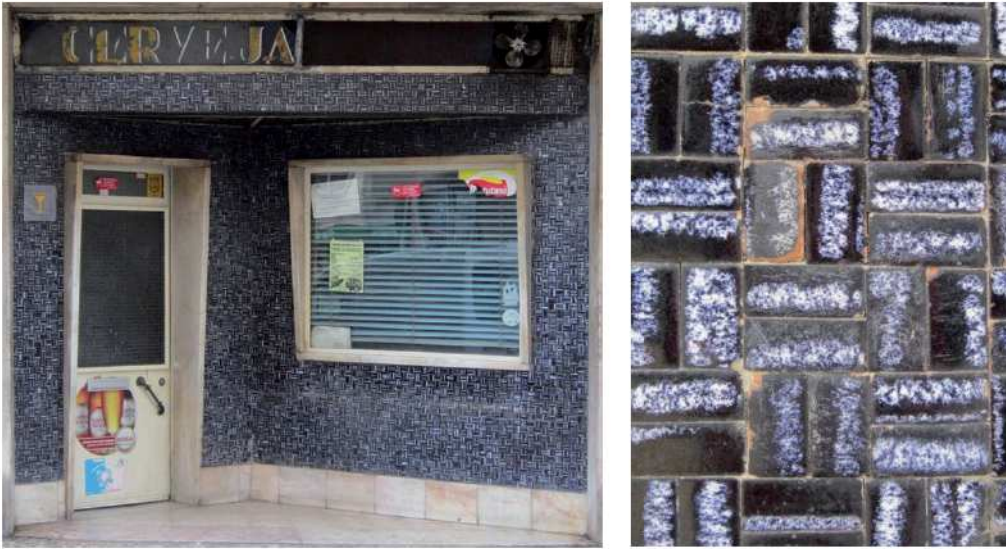
Figure 17: Rua Francisco Marques Beato N° 79, Moscavide

Examples in other locations, such as Moscavide (in Lisbon) and at the nearby city of Amadora are demonstrated in figures 17 and 18. The curious of these coatings is that they are used, more or less sparingly, most anywhere, enriching any building where they are integrated.