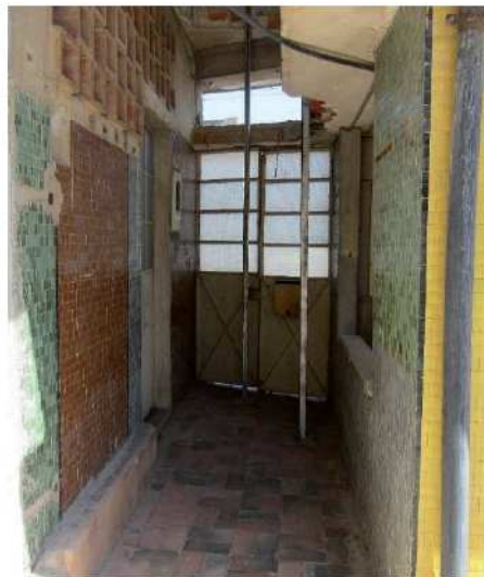
Figure 4: The entrance of the factory. Caxarias , 2018

Figure 5 presents some Tijomel mosaics applied on the walls of the factory and the several possibilities of colours. Many of them have the same pattern that have been found in buildings of Portuguese towns screened by the authors.