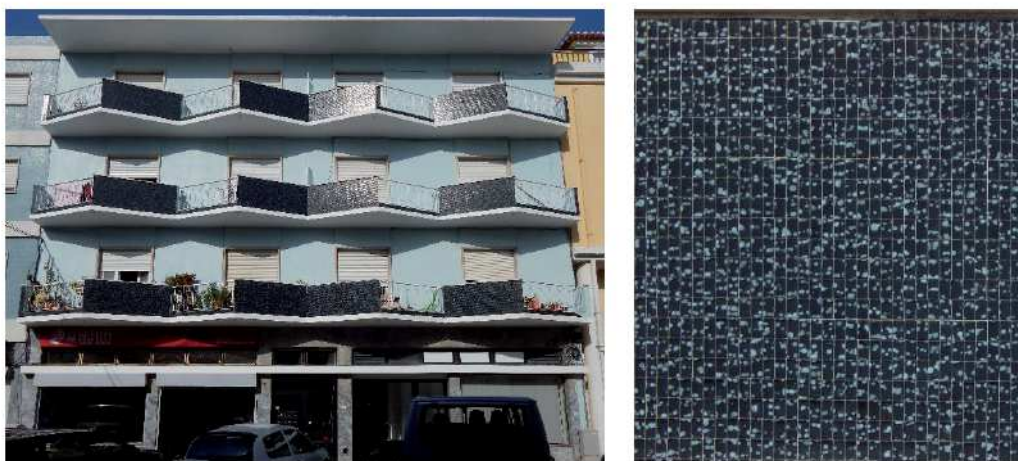
Figure 20: Rua Dias Neiva N° 12, Torres Vedras

In the cases found in Torres Vedras, the integration is slightly different. The mosaics were applied in small areas at the upper part of the buildings, such as decorative details of the balcony seen in figures 20 and 21. Together with the architectural aesthetic of the building (figure 20) their integration creates an aesthetic impact on viewers and enriches the constructions.