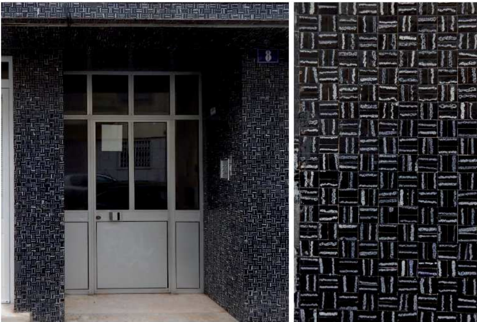
Figure 18: Rua Cândido dos Reis N° 8, Amadora