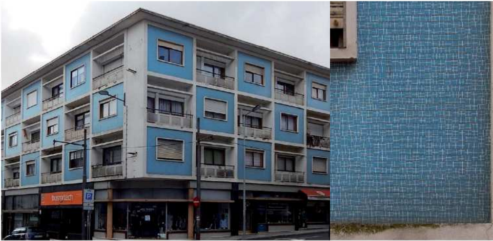
Figure 12: Rua da Boa Hora N° 2, esquina com a Rua de Santa Catarina - Porto

The mosaics in white glaze with a black line, create an aesthetic focus of attention that enriches the whole building. In the second (figure 12) we have a rare case of an extensive use of the Tijomel mosaics in the whole façade. Here the blue of azulejos only framing the protruding windows in the upper part of the building, contrasting with the verandas, like a chequerboard, creating an impact on viewers.