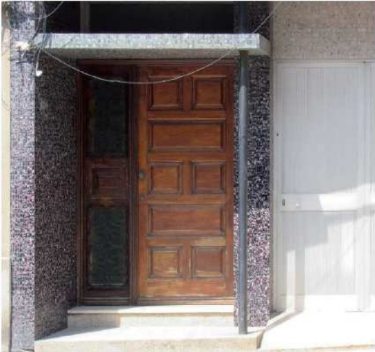
Figure 9 and 10 demonstrate two different examples of Tijomel coatings integrated only in the entrance door of the buildings. The mosaics are very simple with a black background colour superimposed by odd lines in grey or fawn (figure 9) or dots of pink and white (figure 10). It is possible to see that there was a clear intention to decorate the surface appealingly, maybe for the sake of the prospective buyers and for the long-term appreciation of passers-by.