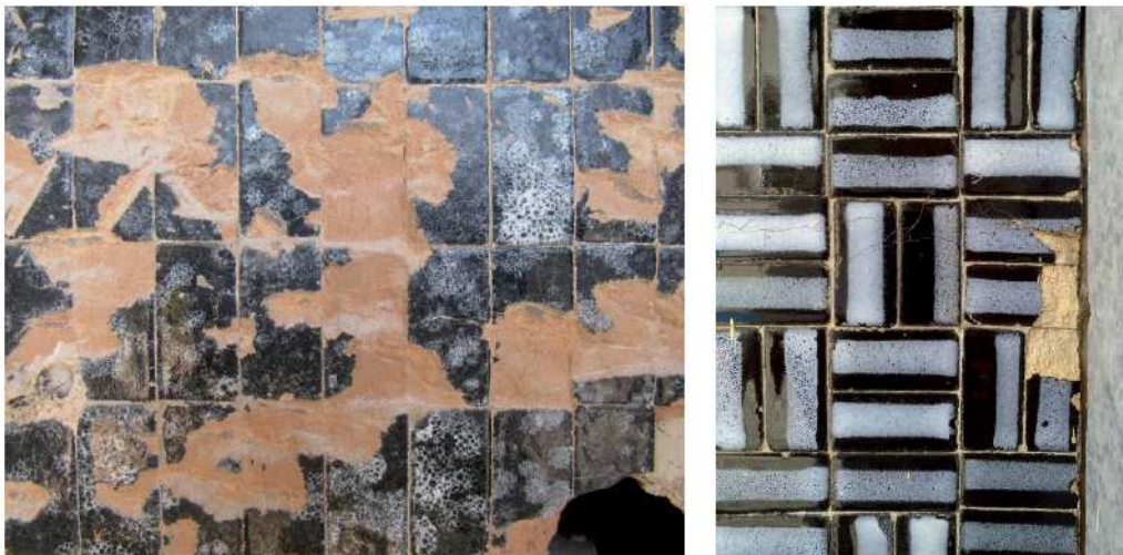
Figure 7: Some (fortunately rare) examples of decayed Tijomel mosaics

The mosaic itself is very simple, it often has a background colour (blue, white, black etc) sometimes overlaid with areas of a different colour as can be seen in the figures. The richness of the application of these azulejos lies in the fact that they obtain an artistic scenario with a "game" of colours (figure 6) or varying the position of the mosaics (alternating vertically and horizontally) as can be seen in figure 7 (right), creating interesting patterns in façade areas that might otherwise look plain.