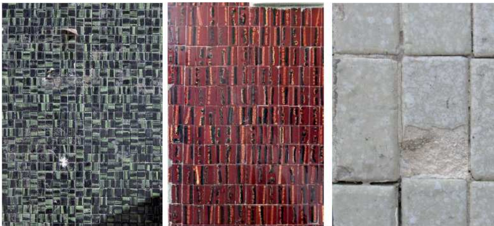
Figure 14: Detail of applied Tijomel mosaics in different buildings in Porto. Left: Praça da Liberdade Nº 121 ; centre: Rua de Fernandes Tomás Nº 493 ; right: Rua Faria de Guimarães Nº 357

Figures 14 and 15 depict some Tijomel coatings in different colours and patterns applied in buildings of Porto and Ourém, the city of extinct Portuguese factory Tijomel.