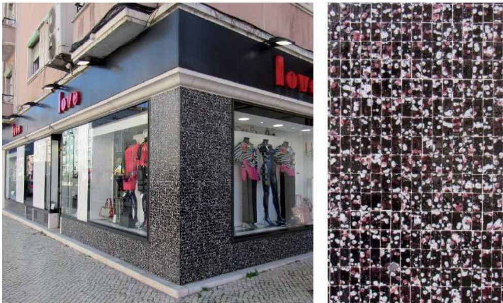
Figure 16: Avenida de Roma N° 19 , Lisbon

Some interesting cases were found in Lisbon and satellite localities. Interestingly, amidst the many patterns and colours available, the local architects and decorators often chose identical solutions to those found in Porto. Fortunately, the vast majority is in a good condition. Figure 16 presents an example in Avenida de Roma in which the lining is part of a shop design and therefore only at street level, imparting, however, a sense of modernity in contrast with the rest of the building that is rather plain and devoid of decoration.