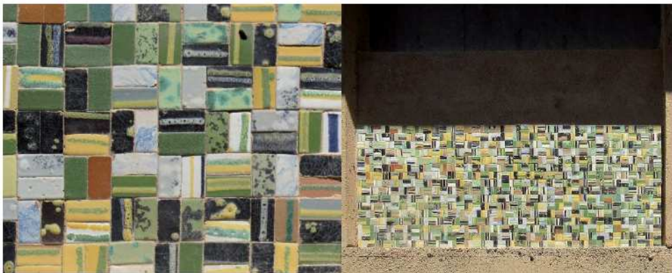
Figure 22: Rua da Cantina, Tijomel factory, Caxarias

Exclusively and much used in Portugal at this period, the innovation is in their peculiar aesthetics and the way they were locally integrated to the modern architecture in Portugal. The possibility of different forms of application, using the same mosaic vertically or horizontally or mixing different colours, offer many possibilities to create a sense of Modern and impact the observers (figure 22).