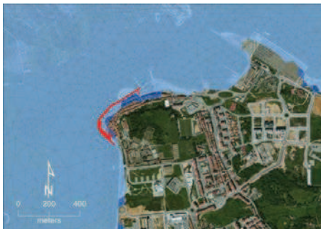
Fig. 2. February 2010 flooding event in SOCC: reconstruction of the flood extension (red patch); model results for the 2010 event (light blue) with SLR (dark blue).

The Seixal waterfront was one of the most affected areas (Fig. 2), in particular the old city centre. In the SOCC a total of 30 houses were flooded, including private homes and commercial buildings, and the traffic on public roads was interrupted.