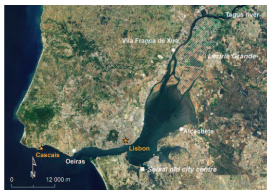
Fig. 1. Study areas in the Tagus estuary (Seixal old city centre and Lezíria Grande de Vila Franca de Xira). Location of: Cascais tidal gauge and Lisboa Geofísico meteorological station.

events in one year is 26% (Rilo et al. , 2015). The same authors point out that these occurrences are broadly distributed along the estuarine margins between Vila Franca de Xira and Oeiras (Fig. 1). The most recent flood event with the greatest impact along both margins occurred on February 27, 2010 associated with the Xynthia storm which had impressive and tragic effects in the southwestern coast of France (André et al. , 2013). The storm was originated in a low-pressure zone, located in the middle of the Atlantic Ocean, which intensified in the morning of the February 27 and changed to a storm when the coastlines of Portugal and Spain where reached (Bertin, et al. , 2014).