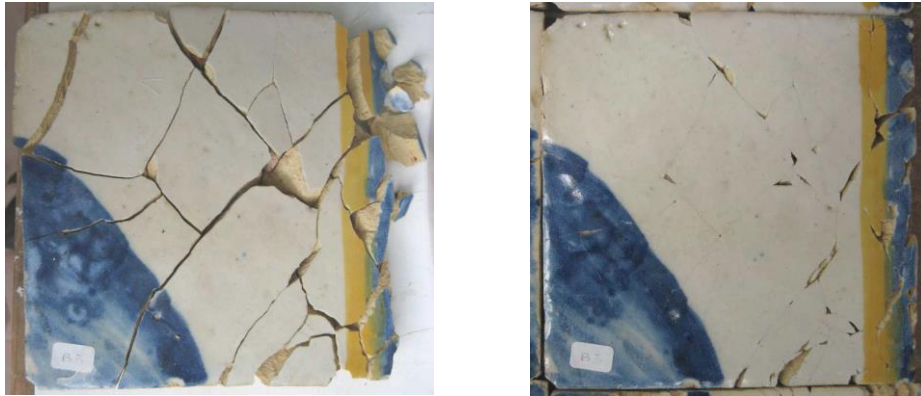
Figure 1. Tile fragments re-adhesion. A) Fragmented tile and b) Tile after fragment re-adhesion treatment.