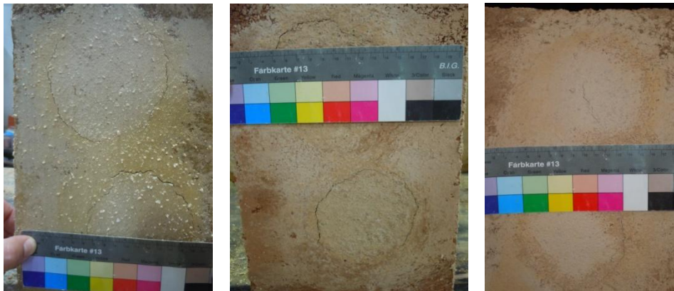
Figure 4: Medium cracks on the mortar MRE_AL15 applied on the standard deep void defects in the blocks: left, in BAv; center, in BPD; and right, in BVC

Analyzing the anomalies observed for the eight families of mortars (Tables 3 and 4 ), it is seen that: