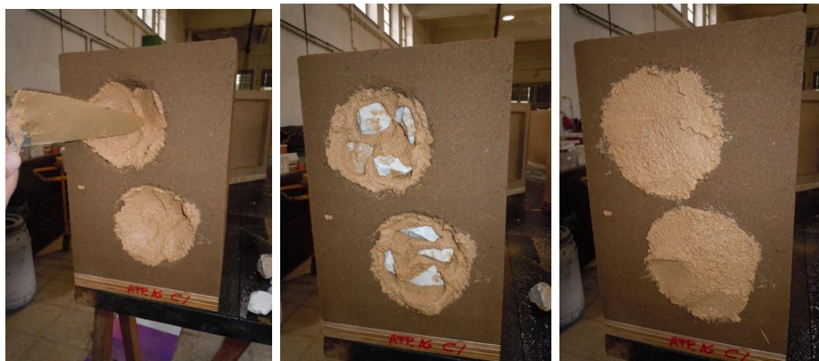
Figure 3: Application of the mortar MRE on a standard deep voids defect of the Av rammed earth