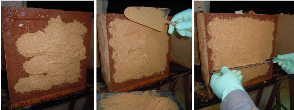
Figure 2: Application of the mortar MRE_AL15 on a standard superficial defect of the PD rammed earth

Immediately after application of the mortar the initial shrinkage begins; this is inhibited by adhesion to the support. This shrinkage leads to the development of shear stresses in the plane of contact between the mortar and the support. This can cause detachment and/or tensile stress in the mortar which can cause cracking. Because of this it was necessary to repoint some cracks. Cracks appeared in the mortars approximately 2 to 3 hours after application, on both types of standard defects and on both types of deep hole defect repairs (with and without coarse gravel). The repointing was undertaken 4 hours after application.