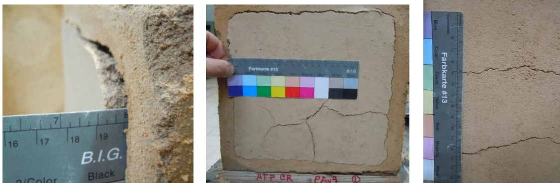
Figure 5: Mortar MRE_NC15 applied in block BAv on standard superficial defect: left, detachment of the mortar; center, cracks; and right, detail of large cracks

These results validate that in practice, it will be more appropriate to repair unstabilized rammed earth walls by means of unstabilized mortars, preferably based on earth similar to that of the substrate. The repair philosophy must be that of: “minimum intervention to ensure long-term stability and optimum performance of the structure without causing physical disruption” (Maniatidis and Walker 2003, p.72).