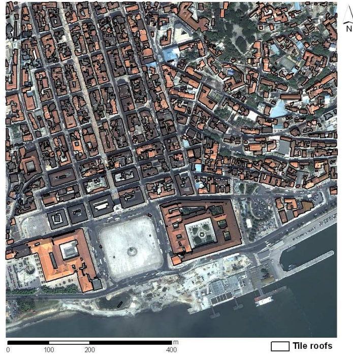
Figure 2. Example of extracted features in study area A-Baixa.

The best extraction of buildings with tile roofs was obtained in study area C, where their boundaries are more regular (lower FD) and their ENN MEAN is greatest.