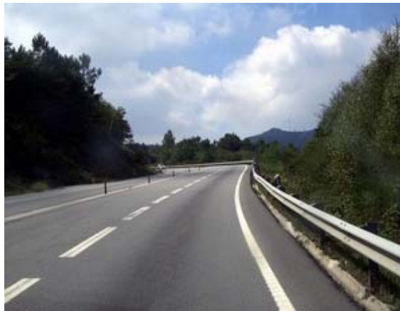
FIGURE 1 IP4 - section with climbing lane.

The analysed stretch of IP4 is a two lane single carriageway road, with an additional lane for slow vehicles in almost all its ascending gradients. The generic cross section is formed by a 3.5 m lane in each direction, an additional 3.0 m lane in alternate directions for slow vehicles, and paved shoulders with 2.5 m (one lane direction) or 0.5 m (dual lane direction).