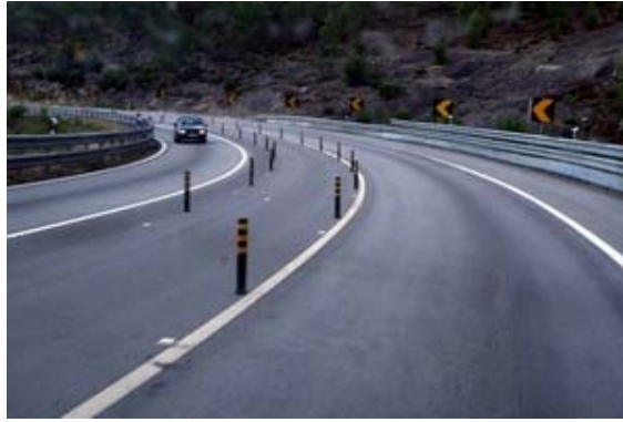
FIGURE 2 IP4 - section with climbing lane suppressed.